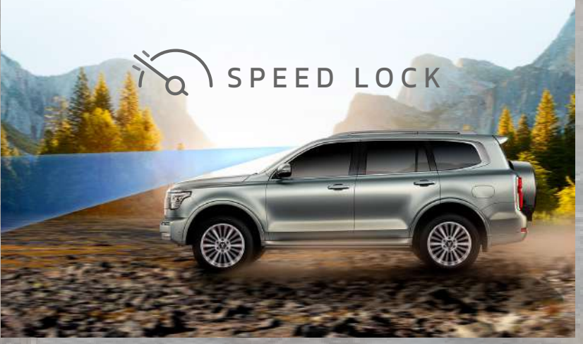
Off-Road Cruise Control Automatic cruise-control system for off-road terrains