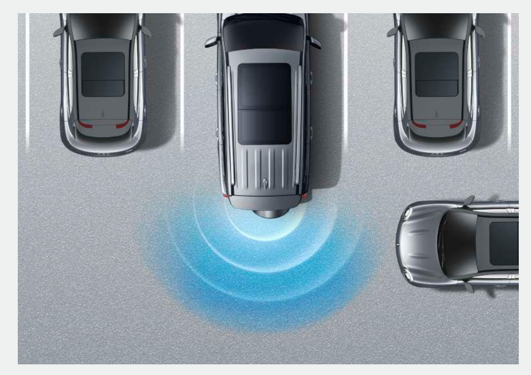
RCTA Rear Cross Traffic Alert RCTB Rear Cross Traffic Braking