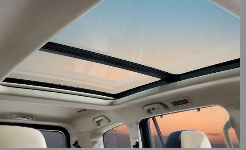
Electric Panoramic Sunroof