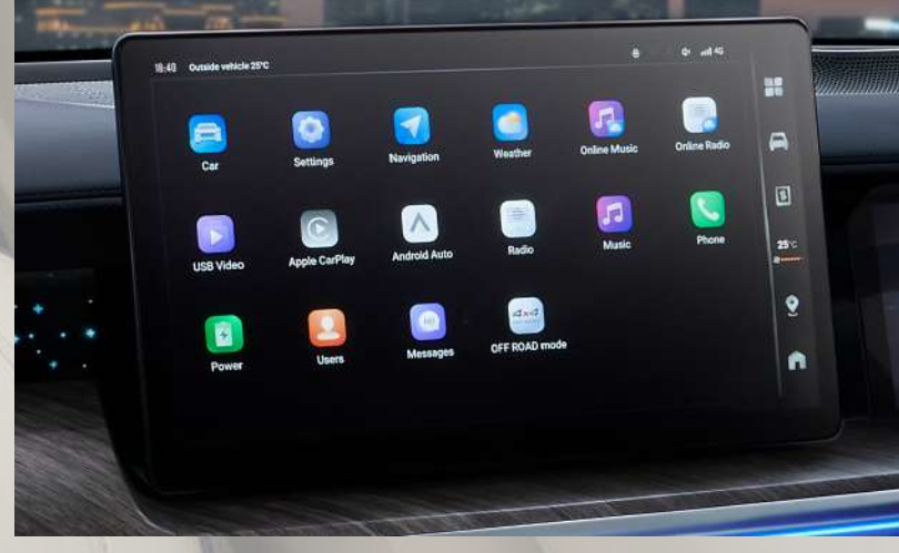
14.6" Entertainment & Control Display 14.6" touchscreen entertainment display console featuring Apple CarPlay and Android Auto compatibility