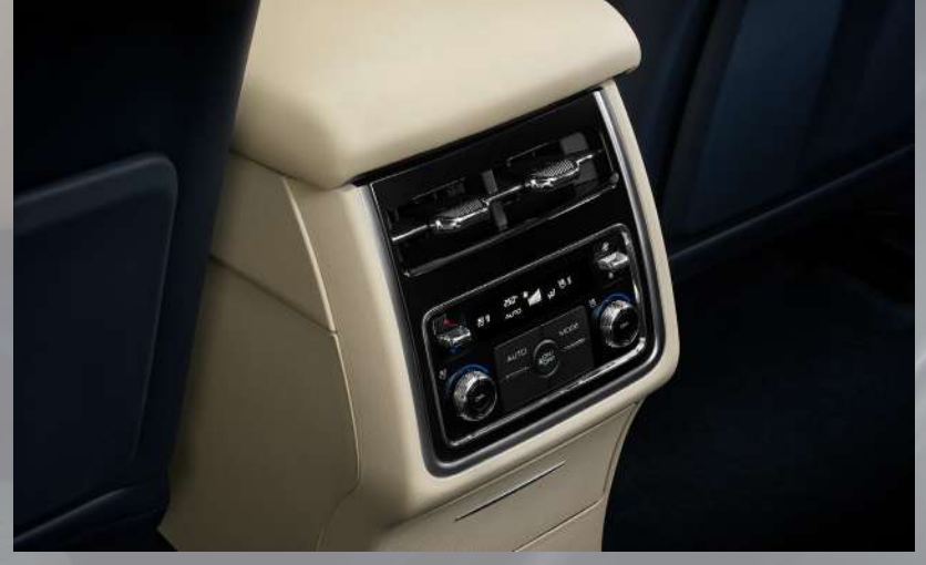
2<sup>nd</sup> Row Ventilation Control Panel