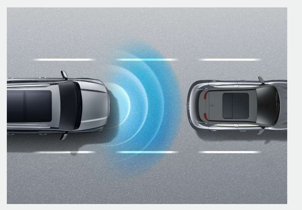
AEBI Auto Emergency Braking + Intersection MEB Maneuver Emergency Braking FCW Front Collision Warning