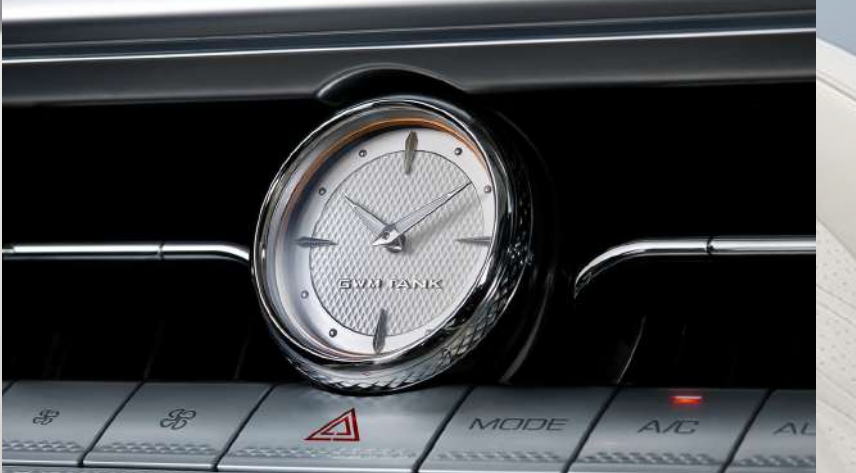
Elegant Classic Clock Stunning timeless chronograph perfectly complimenting the interior ambiance