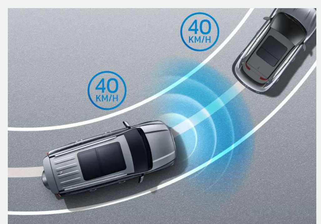
ACC Adaptive Cruise Control ICC Intelligent Cornering TJA Traffic Jam Assist