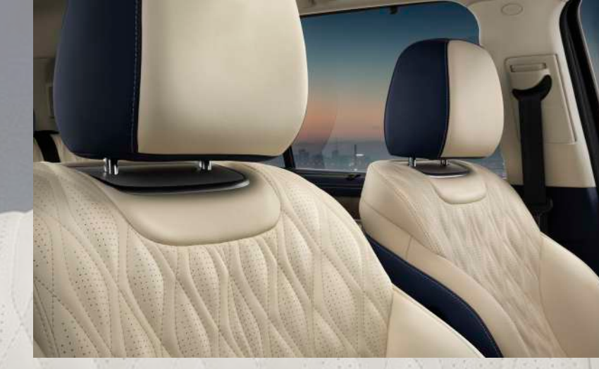
NAPPA Seats Meticulously tailored premium-grade NAPPA leather seats

Experience the sensory pleasure of fine craftsmanship detailedin every aspect of the car and the luxury that can only be experienced through the highest quality materials. Enjoy the journey in this exceptional space, tailor-made for unforgettable memories.