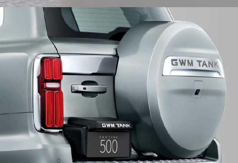
Tailgate with Electric Suction