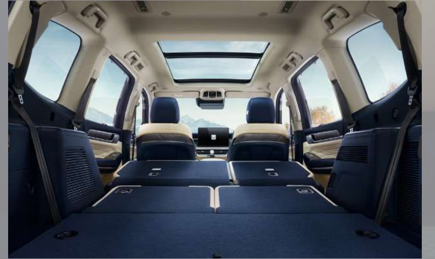
60 : 40 Foldable Seat

Open the door to unveil an inviting cabin designed generously for pure comfort and space. Revel in the journey within a true seven-seater that entertains all your needs.