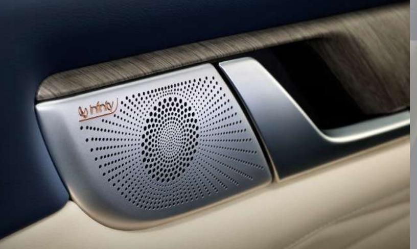
Premium Speaker 12 premium Infinity sound system with independent amplifiers