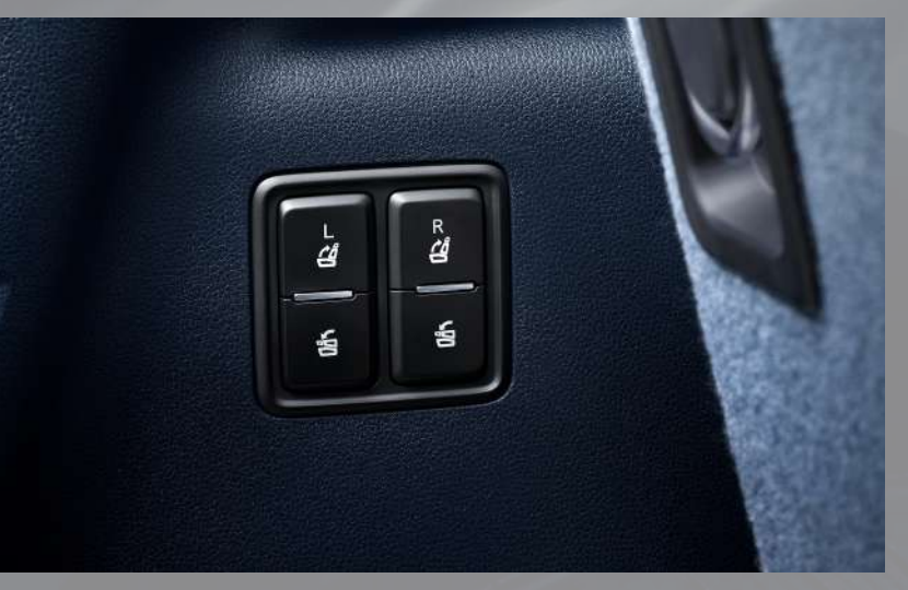
3<sup>rd</sup> Row Seat Control Panel