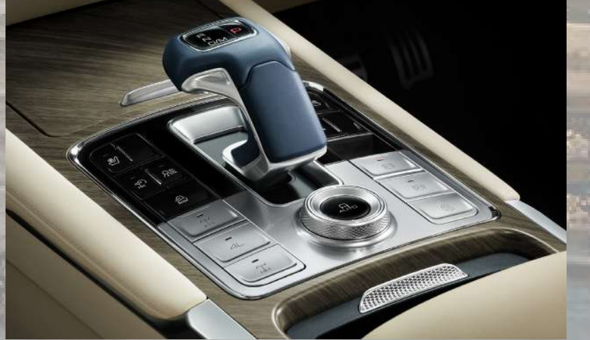
Driving Mode Control 11 driving modes for urban, suburban, and off-road terrain conditions