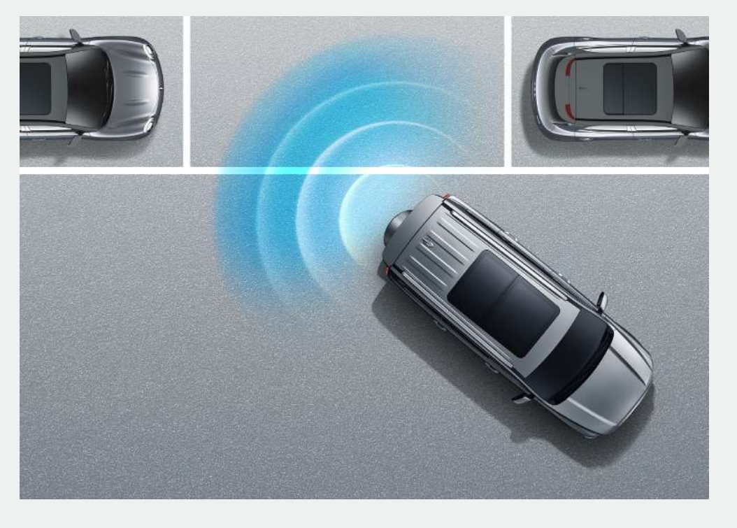
IIP 3 Types of Integration Intelligent Parking 360° Camera Surrounding Camera