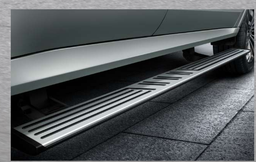
Electric Side Step

More than a unique design, TANK ensures dynamic utility in both urban and off-road terrains, whist maintaining ultimate convenience.