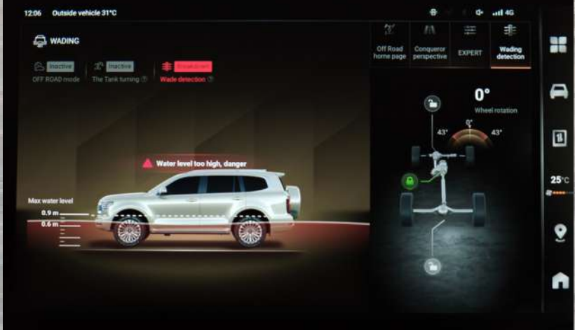
Wading Depth Detection Water depth detection system