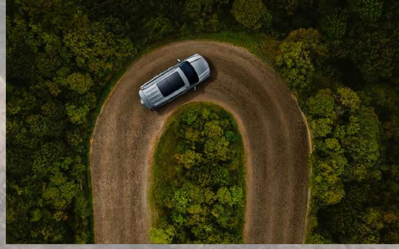
TANK Turn Agile U-turn capability

Tackle the most challenging conditions with absolute confidence. Invite the spirit of exploration with superior off-road technology and break boundaries without limitations.